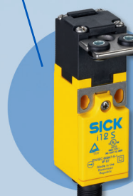
Gate Safety Switch with Actuator Key i12S