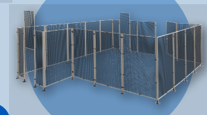
80/20 Aluminum Guarding