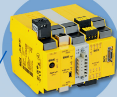
Safety Controller Flexisoft