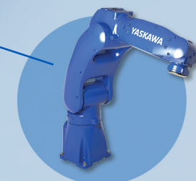
Industrial Robot with Smart Pendant Motoman GP Series