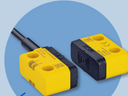
Non-Contact Safety Switch STR1