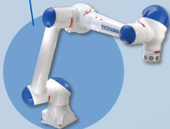
Human Collaborative Robot with Smart Pendant Motoman HC10DT