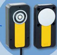
Safety Locking Devices MLP1