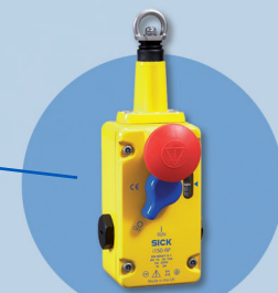
Safety Comand Device 50RP