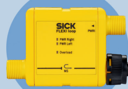
Safe Series Connection Flexiloop