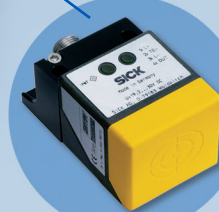
Safe Position Monitoring Sensor